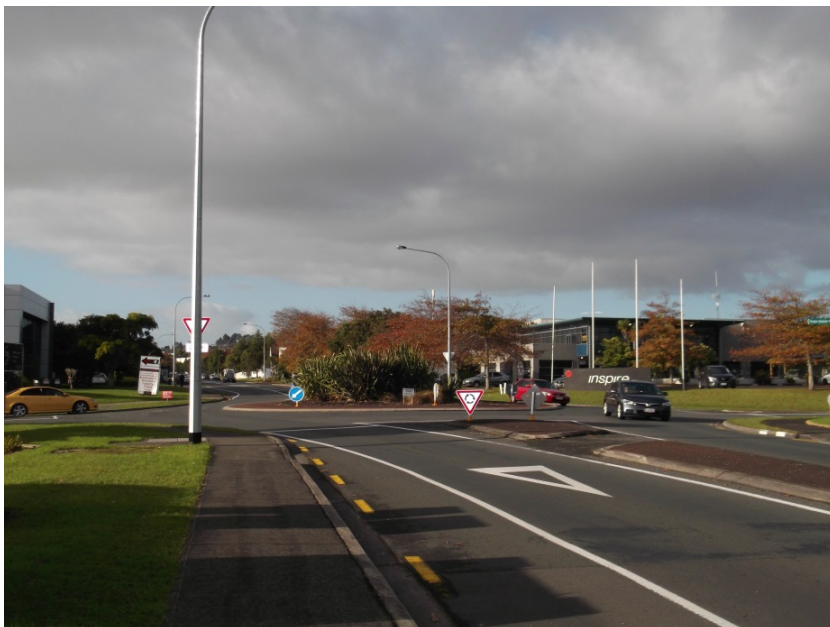
Photograph 23: William Pickering Drive / John Glenn Avenue / Douglas Alexander Parade Intersection

Traffic volume data for Appleby Road was not available from Auckland Transport but based on peak hour flow data from surveys undertaken by TDG, it is estimated that daily traffic volumes on Appleby Road are in the region of 3,500 vpd.