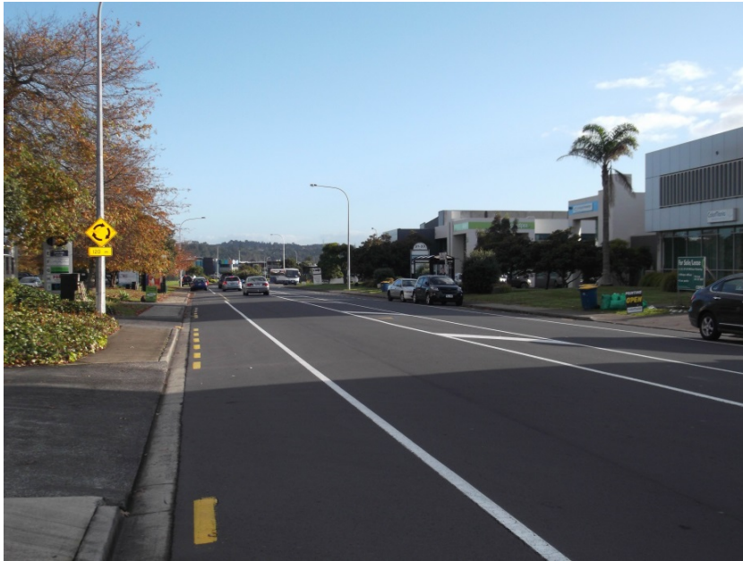
Photograph 24: William Pickering Drive (View North)

In the District Plan, William Pickering Drive is classified as a Secondary Arterial Road.