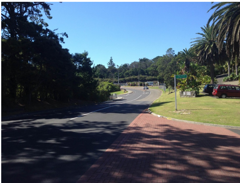
Photograph 14: Tauhinu Road / the Knoll Intersection Looking Towards the SH18 Interchange

Photographs 14 and 15 show the general traffic environment of Tauhinu Road and the proposed site works intersections between The Knoll and the point at which the pipeline route is planned to leave the road corridor and head east to Collins Park.