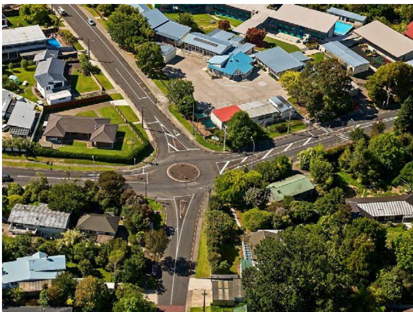
Photograph 16: Greenhithe Road / Churchouse Road / Isobel Road Intersection. View from Churchouse Road

Photograph 16 shows the roundabout intersection of Greenhithe Road with Churchouse Road and Isobel Road.