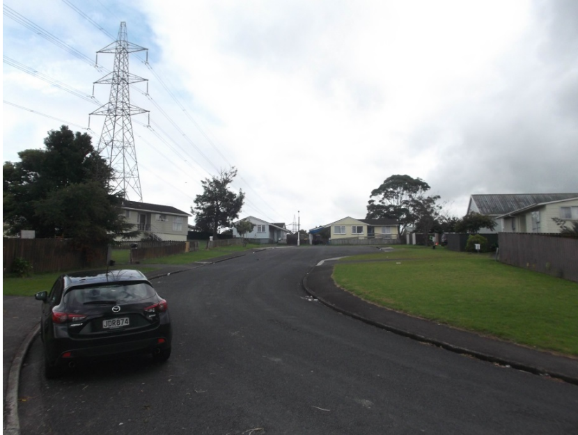
Photograph 3: Kopi Place View to North.