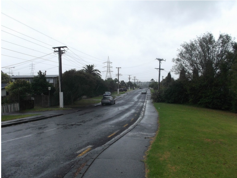
Photograph 5: Huruhuru Road, View to North.

Lowtherhurst Reserve can be accessed from both Huruhuru Road and Redwood Drive. There is no vehicle access within the reserve, however a pedestrian trail and bridge provides walking access between Huruhuru Road and Redwood Drive.