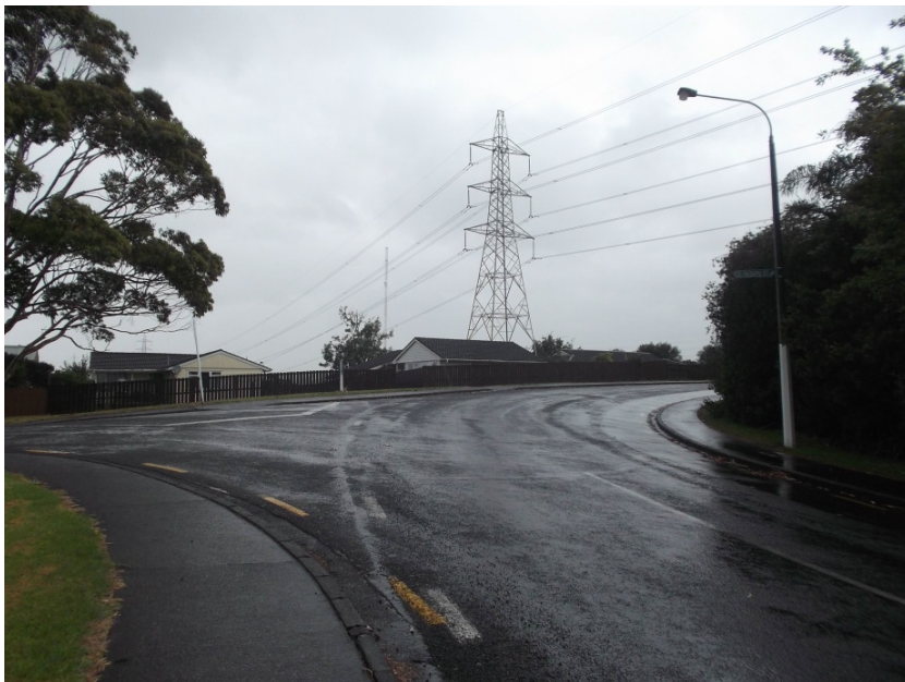
Photograph 4: Huruuru Road / Taitapu Street Intersection View to South (the houses at the end of Kopi Place can be seen in the centre of the photograph).

Kopi Place and all surrounding roads have a speed limit of 50km/h.