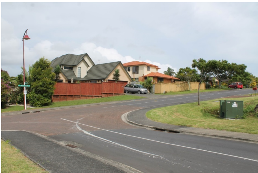
Photograph 11: Jadewynn Drive / Ruze Vida Drive Intersection. The intersection of Ruze Vida Drive and Berkshire Terrace is at the Upper Right of the Photograph by the Red Car