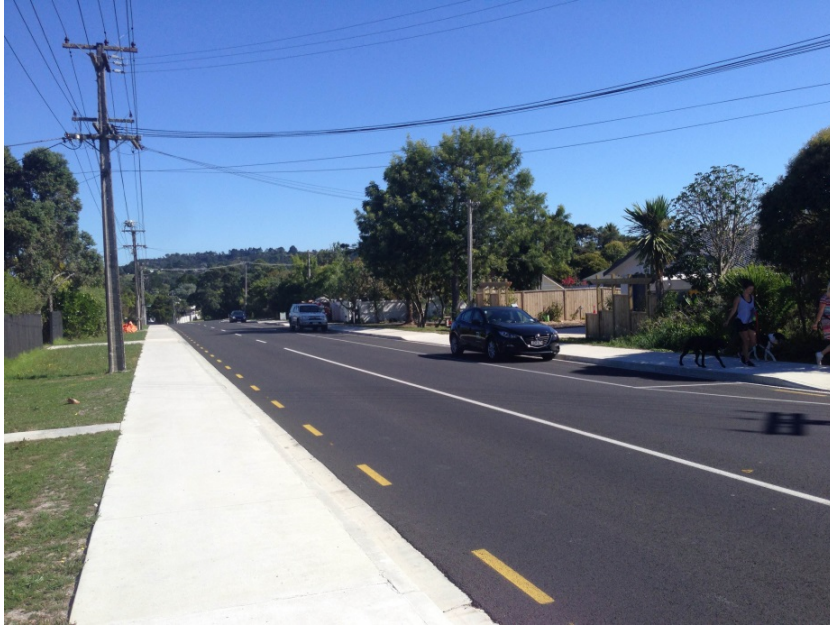
Photograph 15: Tauhinu Road / Marae Road / Shiloh Way Intersection Looking North, the Turn to the East Will Occur Approximately In the Mid-point of the Photograph

Properties fronting Tauhinu Road and the adjoining side streets are generally residential in nature, in keeping with the current Residential 1 zoning.