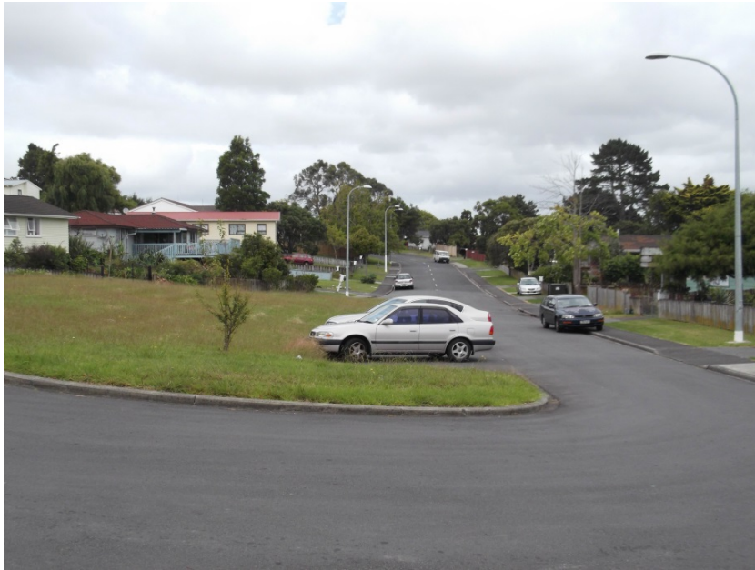
Photograph 8: Cul-de-sac End of Cedar Heights Avenue