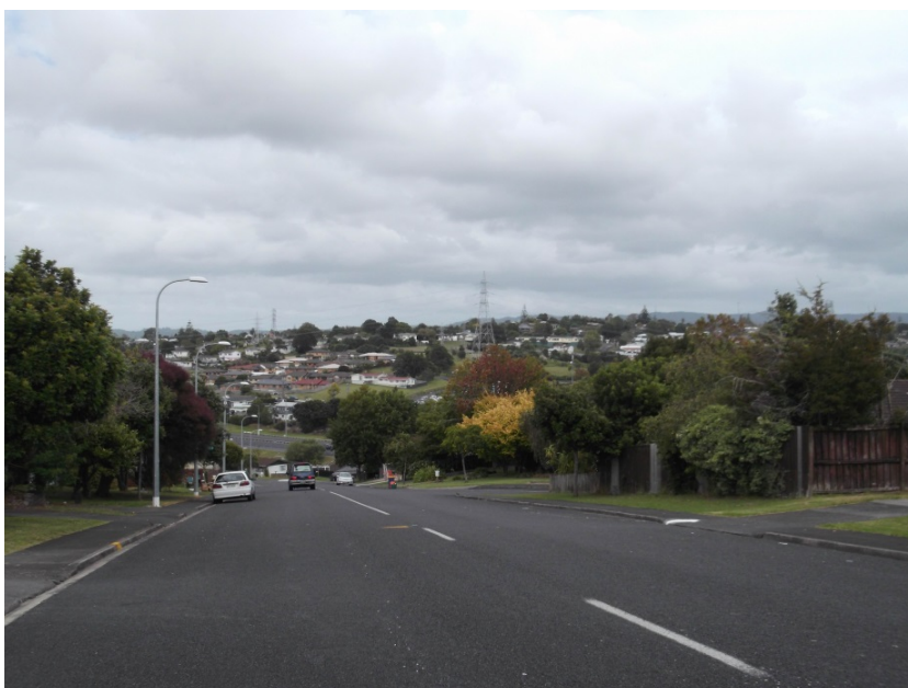
Photograph 7: Cedar Heights Avenue Looking South Towards Redwood Drive

Photographs 7 to 9 show the general traffic environment of Cedar Heights Avenue and the proposed site works intersections between Redwood Drive and Holmes Reserve.