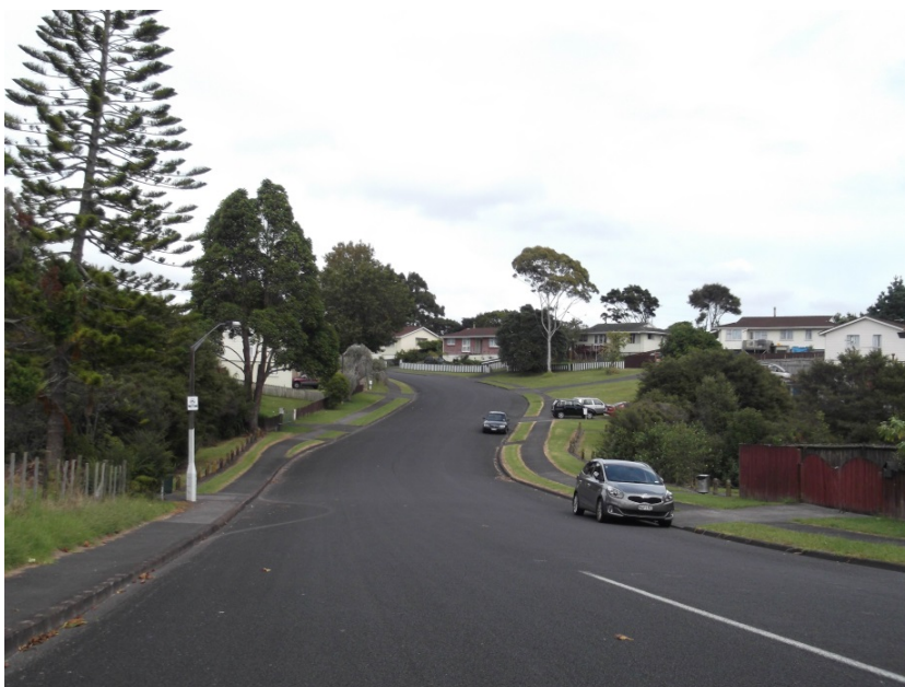
Photograph 13: Holmes Drive Looking North Towards Intersection with Oriel Avenue

Photograph 13 shows the general characteristics of Holmes Drive.