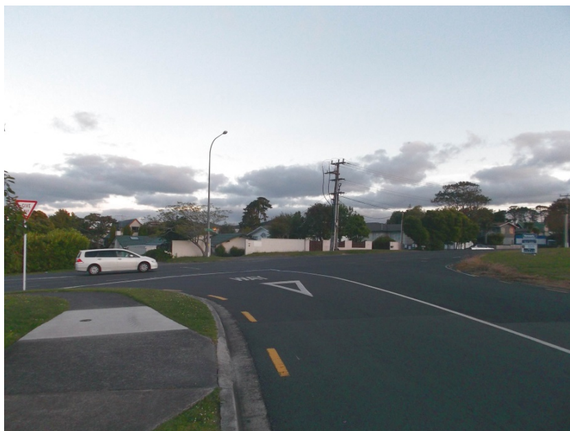
Photograph 21: Appleby Road / Albany Highway Intersection (from Appleby Road)

Photograph 21 shows the Appleby Road / Albany Highway intersection.