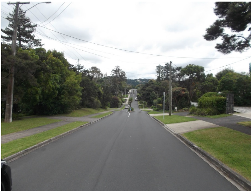
Photograph 18: Churchouse Road, Typical Carriageway

Churchouse Road has narrow carriageway with a 6m width from kerb to kerb. There are traffic calming measures in the form of central islands and planting as shown in Photograph 18 below.