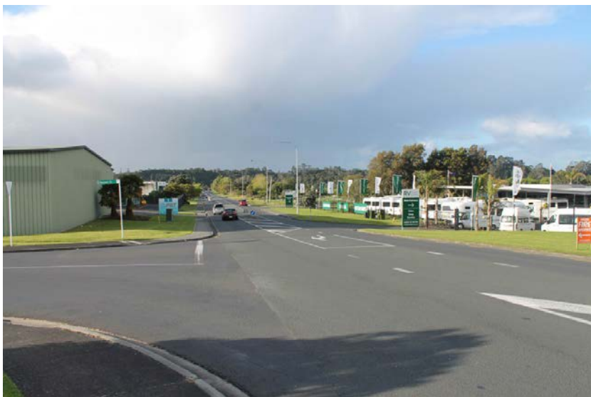
Photograph 26: Intersection of Piermark Drive / Bush Road

The intersection of Bush Road and Piermark Drive is a priority “T” intersection with priority given to traffic on Bush Road. The intersection is shown in Photograph 26 below.