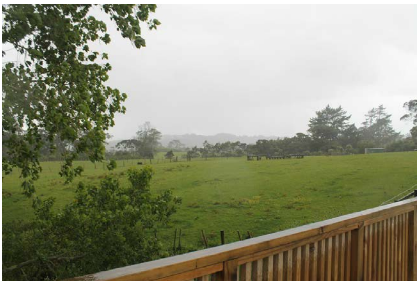
Photograph 17: Wainoni Park from Greenhithe Road

Properties fronting Greenhithe Road and the adjoining side streets are generally residential in nature, in keeping with the current Residential 1 zoning.