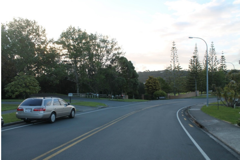
Photograph 19: Schnapper Rock Road Facing North, the Entrance to the Memorial Park Can Be Seen In the Centre of the Photograph