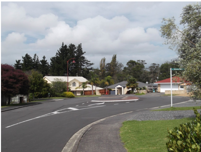
Photograph 10: Cul-de Sac end of Berkshire Terrace, The Designation Enters Though 15 Berkshire Terrace (the cream house left of centre in the photo)

Photographs 10 to 12 show the general characteristics of the roads on this section of the route with a particular emphasis on the locations adjacent to the proposed construction sites.