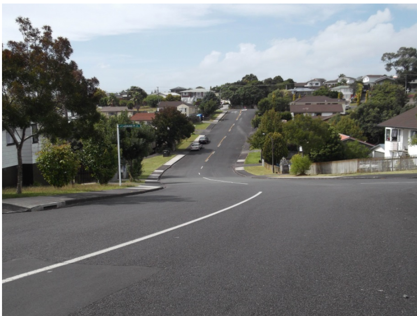
Photograph 9: Holmes Drive South, Holmes Reserve Can Be Seen Left of Centre in the Photo

It is not intended to have any works on Royal Road or Holmes Drive South, but vehicle access via these roads will be required.