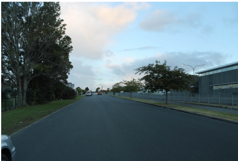
Photograph 20: Appleby Road, Looking Towards Albany Highway

Photograph 20 shows the carriageway and surrounds of Appleby Road.