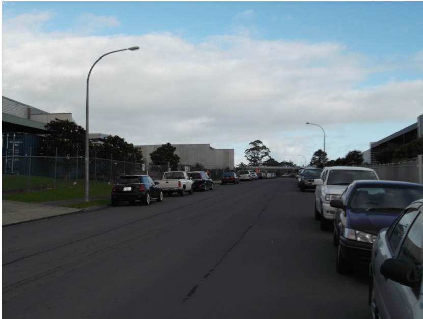
Photograph 22: John Glenn Avenue View towards No. 14 John Glenn Avenue

The intersection of William Pickering Drive, John Glenn Avenue and Douglas Alexander Parade is a four-leg roundabout. The roundabout has a single circulating lane and the central island has a diameter of 15m.