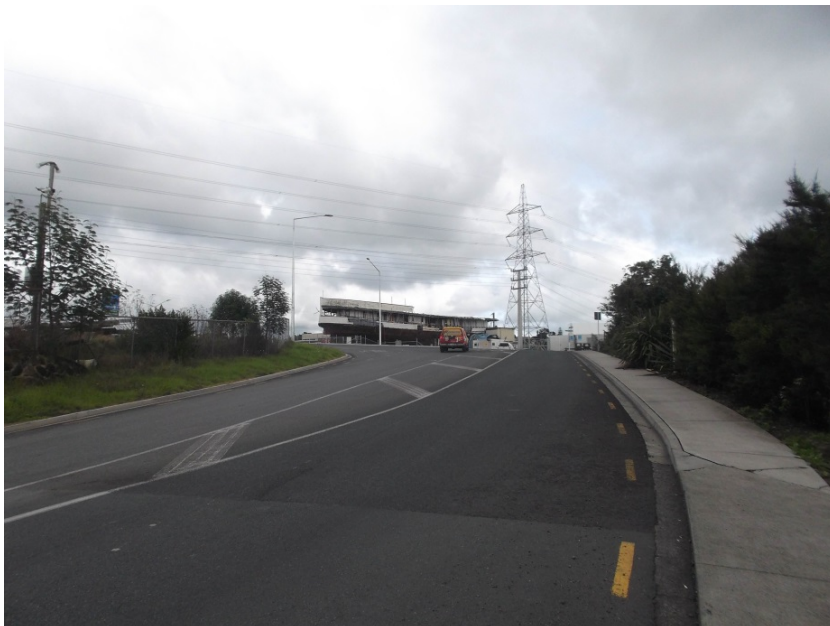
Photograph 2: The Concourse / Selwood Road Intersection

Both The Concourse and Selwood Road have a 50km/h posted speed limit.