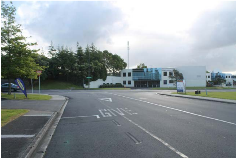
Photograph 25: William Pickering Drive / Piermark Drive Intersection

Piermark Drive is approximately 500m long and has a typical carriageway width of 10.5m. One traffic lane in each direction is provided and kerbside parking is permitted along most of both sides of the road.