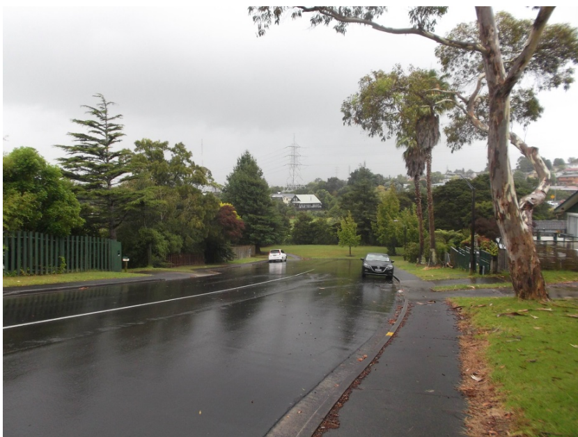
Photograph 6: Redwood Drive, View South from Intersection with Cedar Heights Avenue

Redwood Drive has a total length of 520m, with the section to the south of Cedar Heights Drive where construction works will occur being 75m in length. One traffic lane is provided in each direction, with a centreline marking typically only provided in the vicinity of the intersections with intersecting side roads. There is a distinct gradient on Redwood Drive, sloping down towards the Lowtherhurst Reserve. This can be observed in Photograph 6 below.