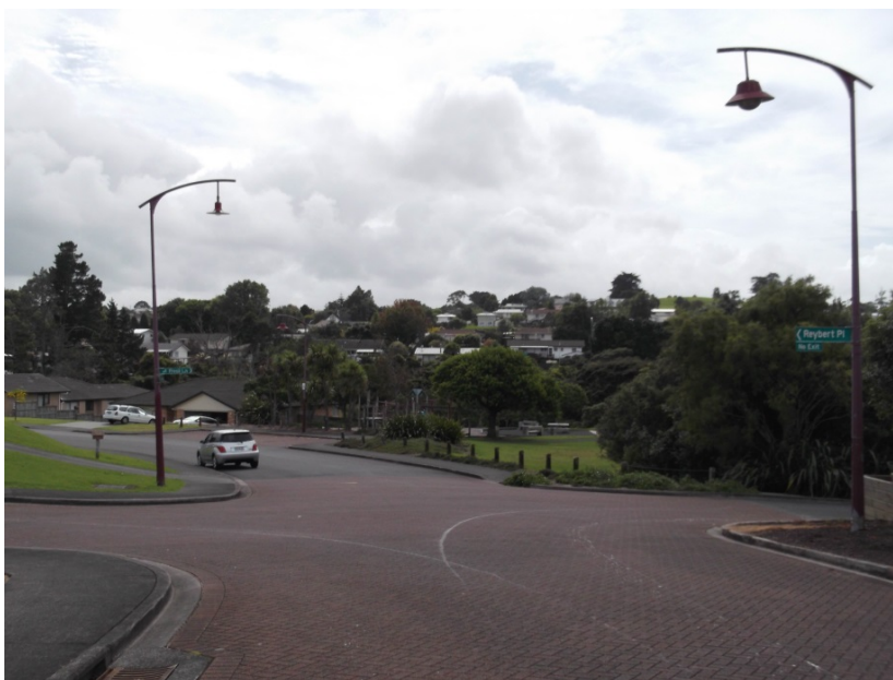
Photograph 12: Jadewynn Drive and Mautewhau Reserve

All roads in the section of the designation route have a speed limit of 50km/h.