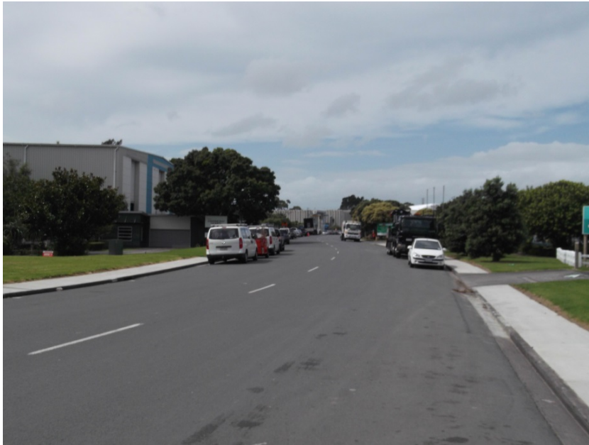
Photograph 1: The Concourse Looking South Towards the Transfer Station and Pump Station